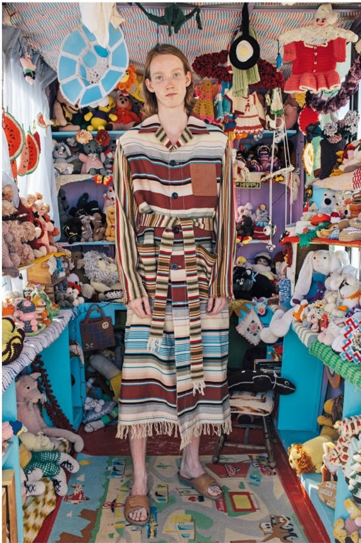
Look LOEWE, Sandalen PRIVAT