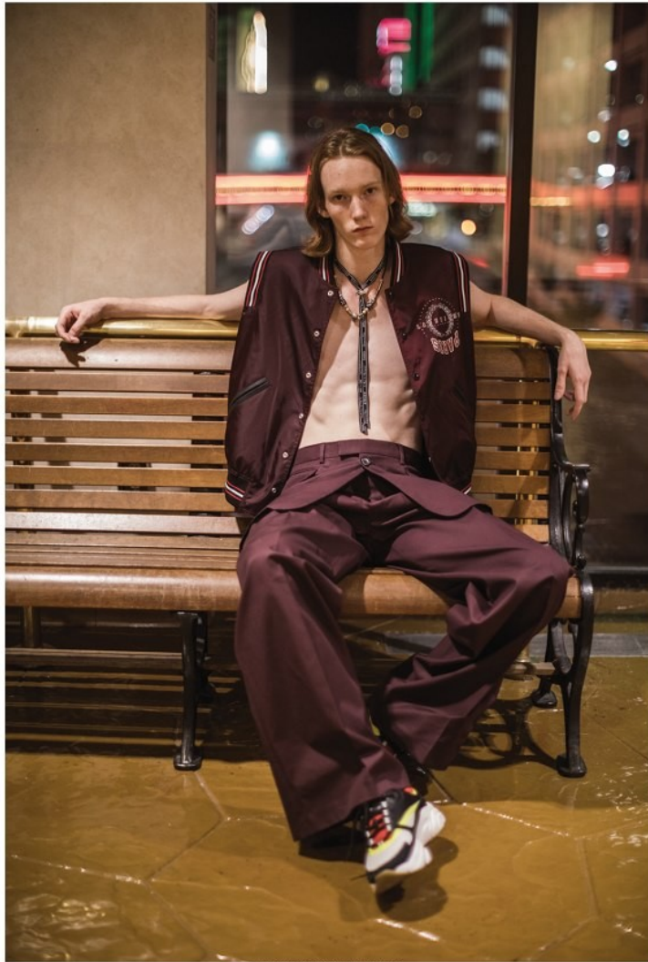
Look DIOR HOMME