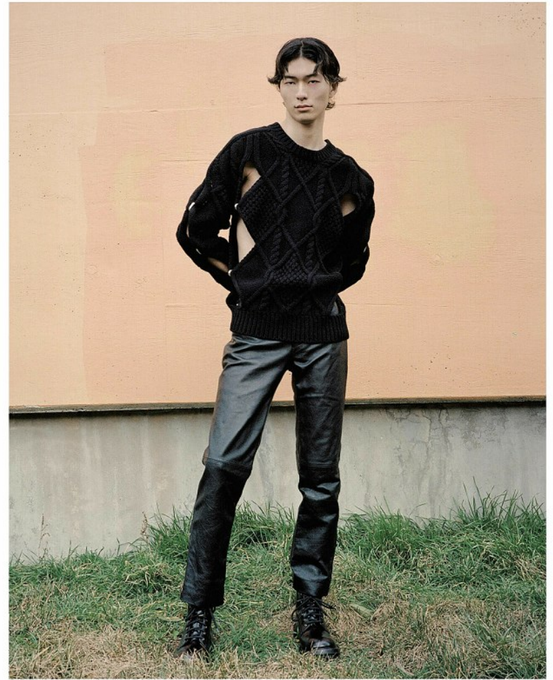
Wool knit cut-out jumper, calfskin leather trousers, and calfskin leather boots Alexander McQueen . [Opposite] calfskin leather coat Loewe