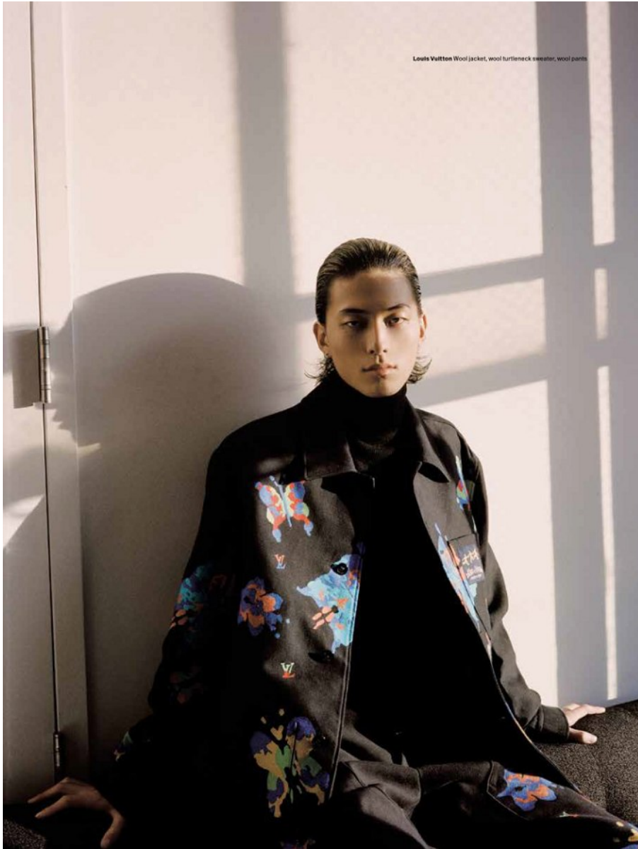
Louis Vuitton Wool jacket, wool turtleneck sweater, wool pants