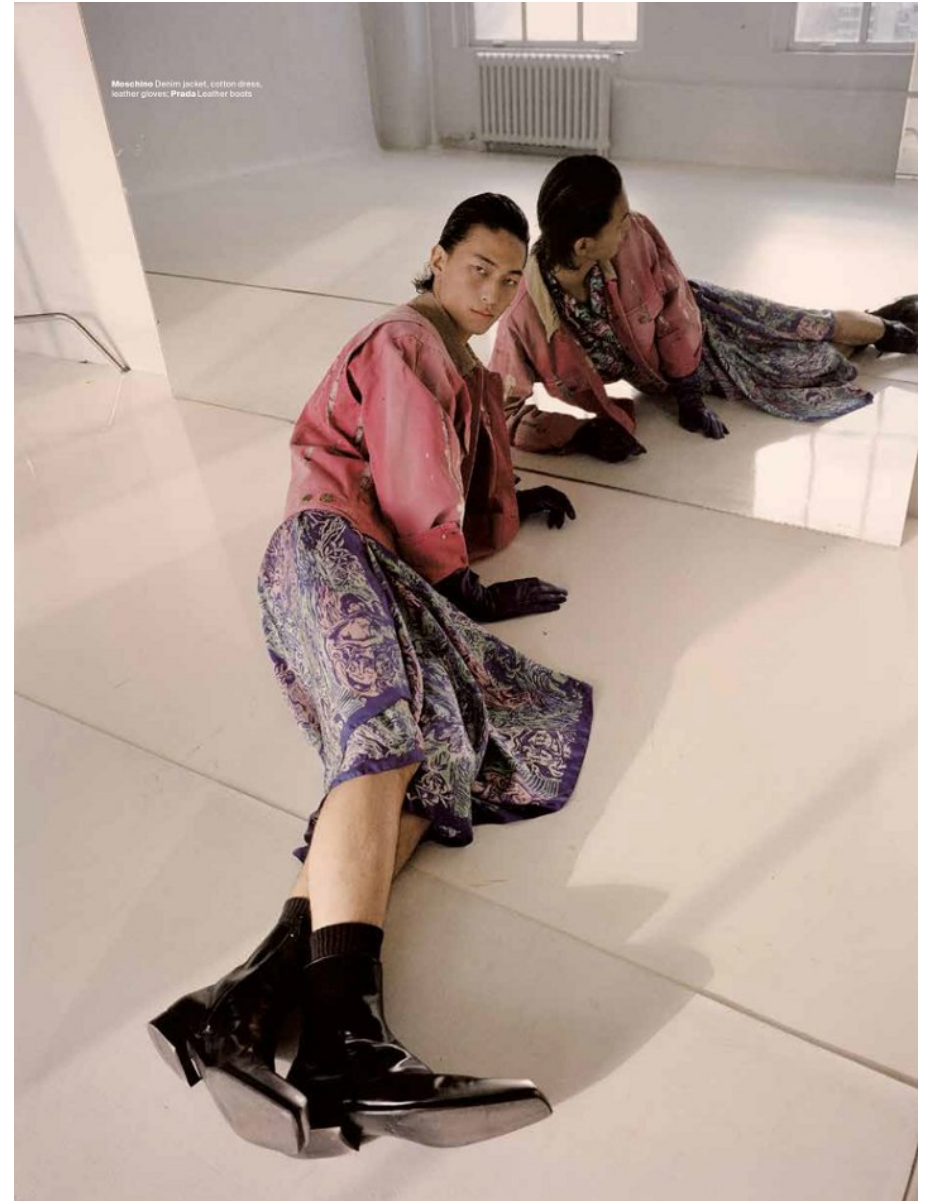
Mesochino Denim jacket, cotton dress, leather gloves; Prada Leather boots