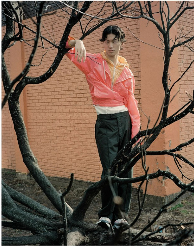
Technical fabric windbreaker, cotton tank top, cotton wool trousers, and calfskin leather sneakers HERMÈS . [Opposite] nylon and mesh top, grain de poudre trousers, calfskin leather and scuba gloves, and canvas micro bag with silk micro scarf ESSE