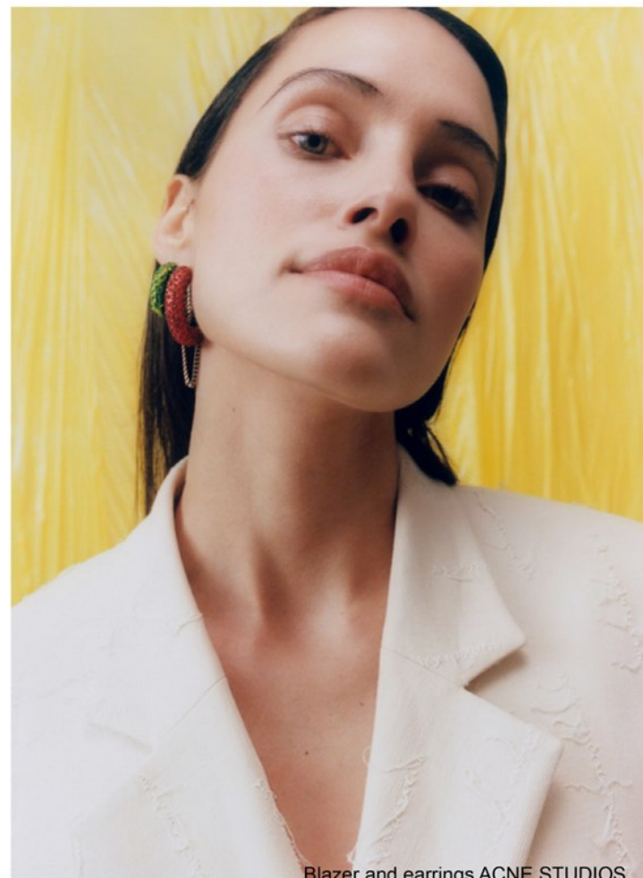
Blazer and earrings ACNE STUDIOS