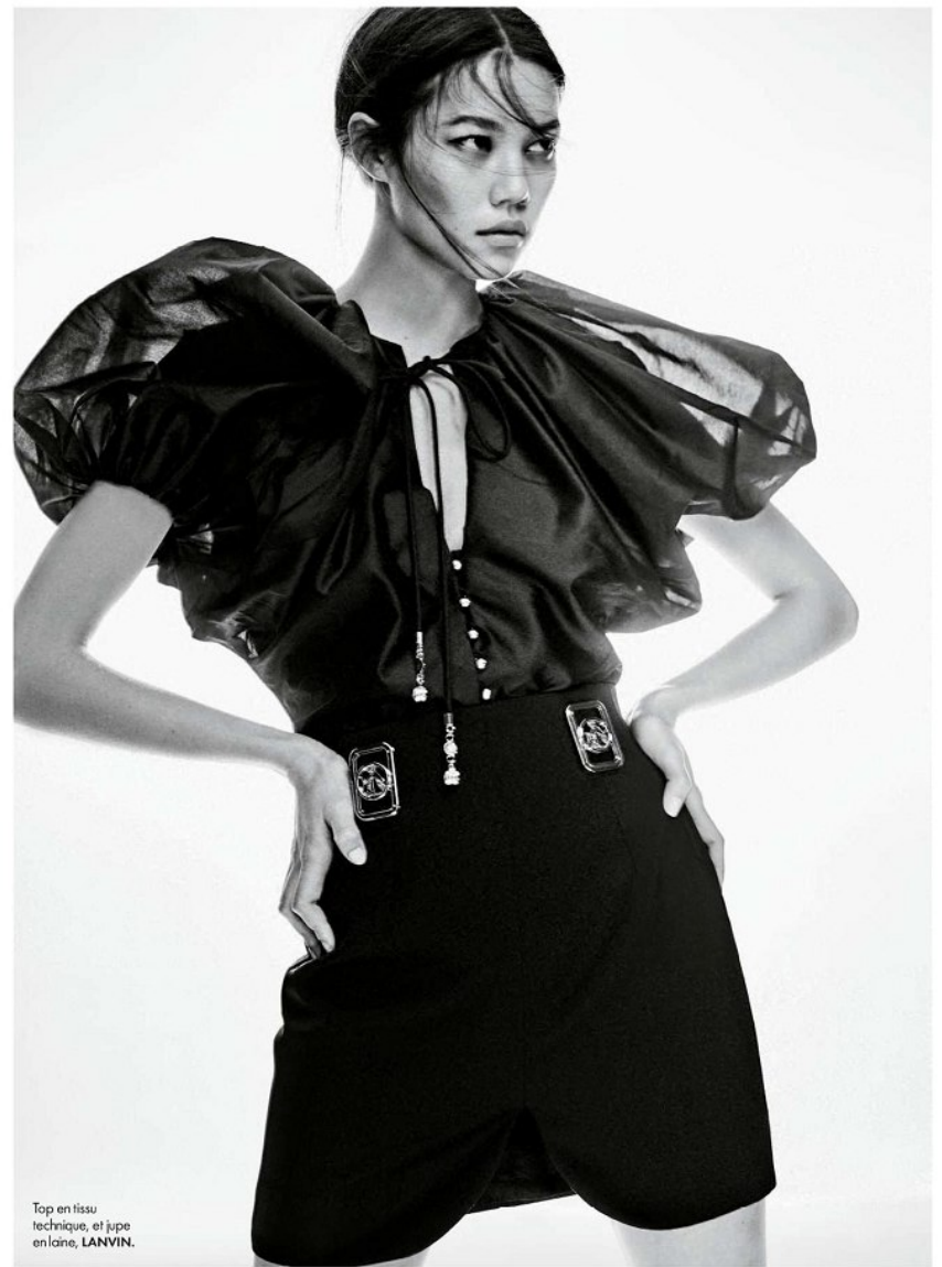
Top en tissu technique, et jupe en laine, LANVIN.