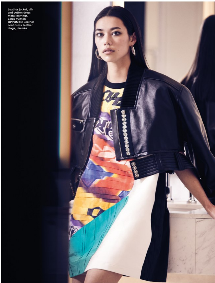
Leather jacket: silk and cotton dress; metal earrings, Louis Vuitton OPPOSITE: Leather coat dress; leather clogs, Hermès