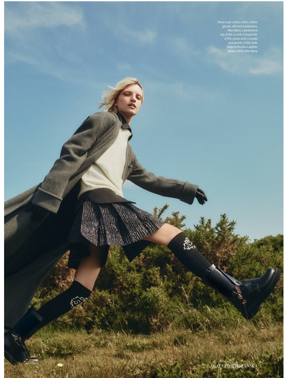
Wool coat, cotton shirt, cotton gloves, all from a selection, Max Mara. Lambswool top, E295, Le Kilt, Dicoqui kilt, E795, socks with crystals and pearls, E395, both Simone Rocha. Leather boots, E950, Max Mara