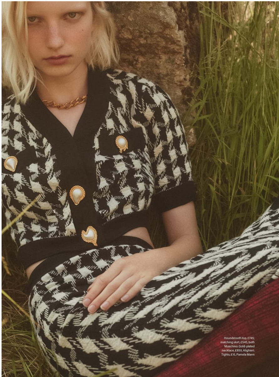
Houndstooth top, E745; matching skirt, E045, both Moschino. Gold-plated necklace, E850, Aleghieri. Tights, E10, Pamela Mann