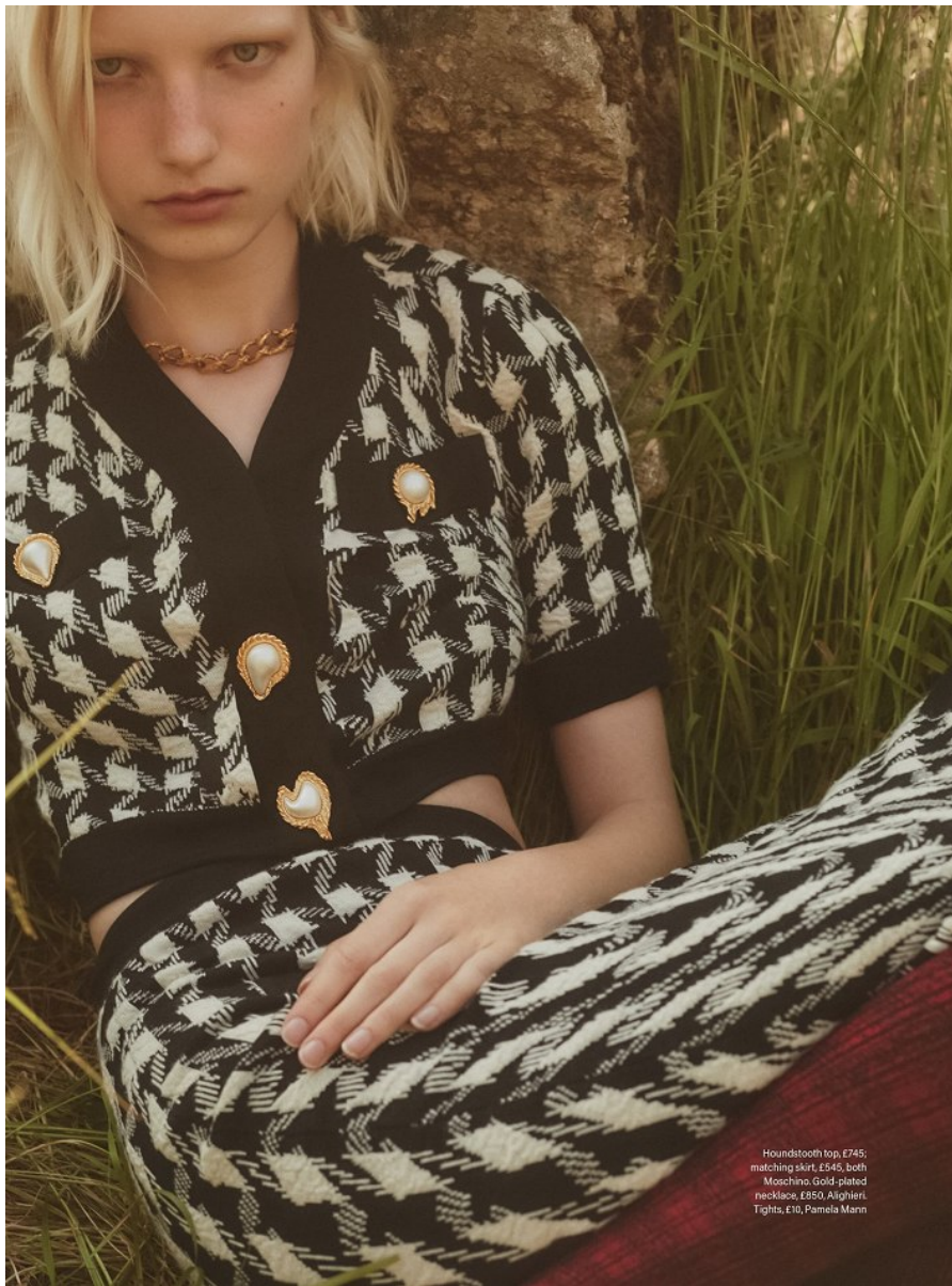
Houndstooth top, E745; matching skirt, E045, both Moschino. Gold-plated necklace, E850, Aleghieri. Tights, E10, Pamela Mann