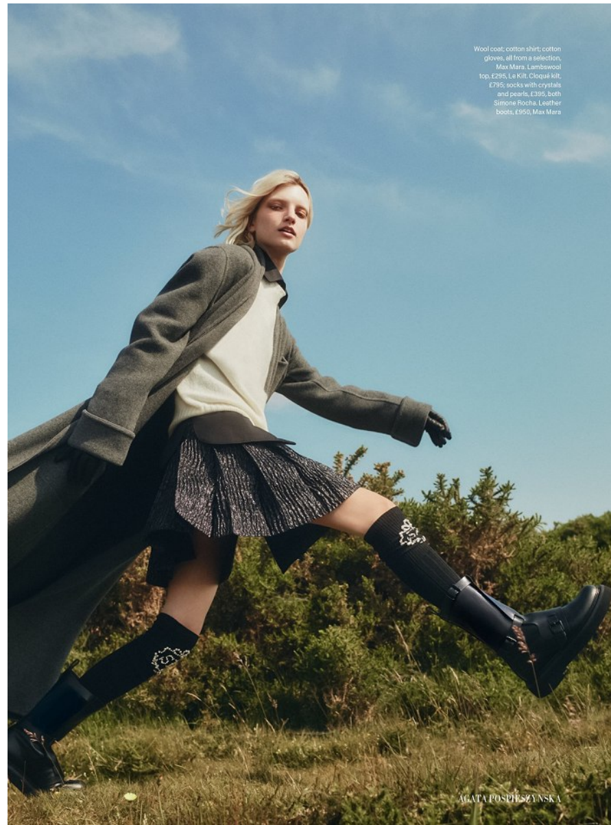
Wool coat, cotton shirt, cotton gloves, all from a selection, Max Mara. Lambswool top, E295, Le Kilt, Dicoqui kilt, E795, socks with crystals and pearls, E395, both Simone Rocha. Leather boots, E950, Max Mara