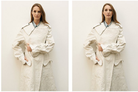
Trench-coat en matière technique. JOSEPH. Chemise en coton. JIL SANDER.