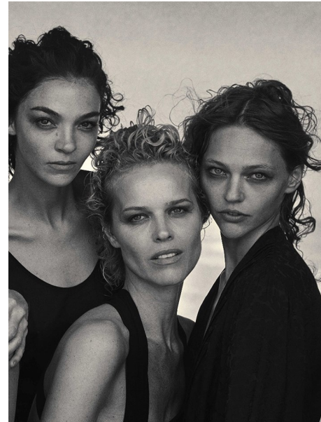
Page de droite: trench-coat en diam. STELLA MCCARTNEY. Chemise en coton. DANIE. Pantalon en coton chez CASSE MÉRCALETTE. À son pied droit, moccasins en cuir, MAISON