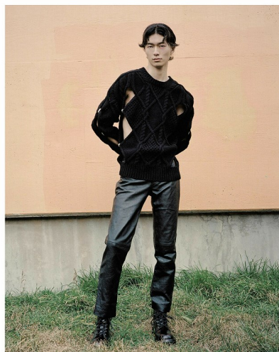
Wool knit cut-out sweater, calfskin leather trousers, and calfskin leather boots (Epoxy) nylon. (Epoxy) calfskin leather over latex.