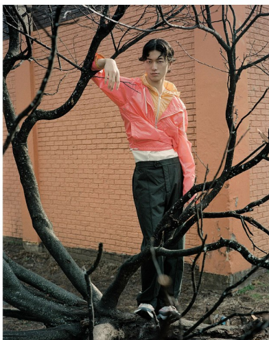
Technical fabric: asidobonded, cotton tank top, cotton wool trousers, and calfskin leather sneakers (strap). (Epoxy) nylon and mesh top, jacket for people (sweater), calfskin leather and suede gloves, and canvas sneaker bag with silk micro scarf filter.