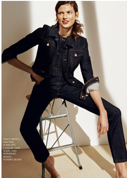
Veste CAROLL, sweat-veste et jean APC. à manches, veste MAJE, veste WEEKDAY, chemise TOMMY JEANS.