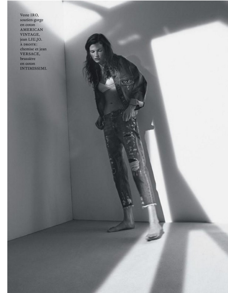
Veste IRO, hooded-gorge en cooton AMERICAN VINTAGE, jean LIU JO, à manchet chemise et jean VERSACE, brassière en cooton INTIMISSIMI.