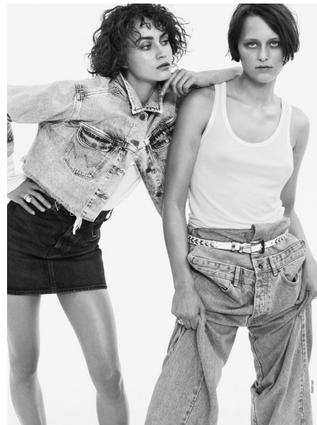
anm.com No. 147022