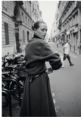
Pullover aus Wolle und Kaschmir; Mid-Faltenjuppe aus Mohair; Gürtel aus Leder, alles von PRADA. Rollerjuppenpullover privat