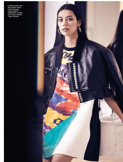
117 HARPER'S BAZAAR FEBRUARY 2021