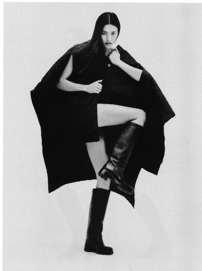
Cape en laine et Nylon, BURBERRY. Bottes, FREE LANCE.