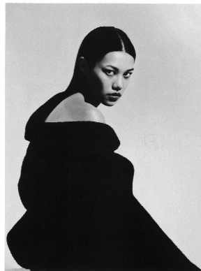
Manteau en laine, LORO PIANA.