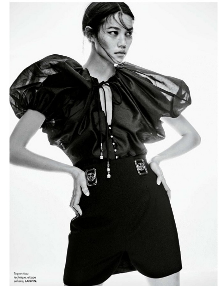
Top en tulle technique, et jupe en tulle, LANVIN.