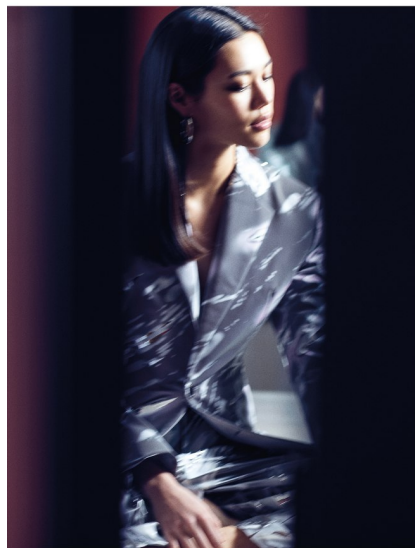
118 HARPER'S BAZAAR FEBRUARY 2021