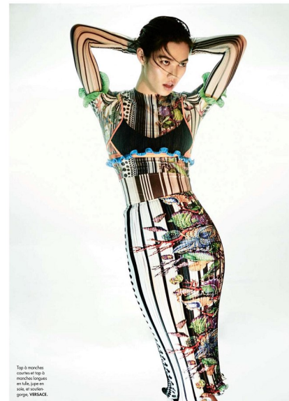
Top à manches courtes et top à manches longues en tulle, jupe en tulle, et accessoires, VERSACE.