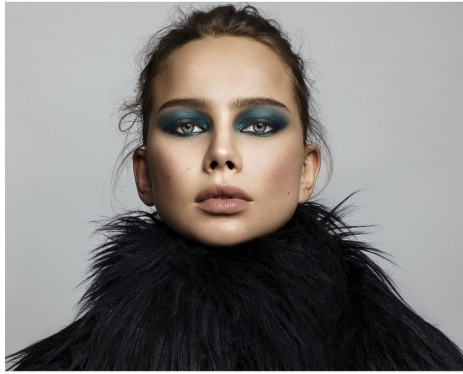
Face: Love Flush in Love Hammer, TOO FACED, Eyes: Eye Color Quad in 191 Printer Kill and 192 Blue Lagoon, CLÉ DE PEAU BEAUTÉ, Lips: Matte Revolution Espalck in Matte 1999, URBAN DÉCAY. Opposite page: Face: Cachouze Foundation in Ombre Nude, No. 22 BE BEAUTY BEAUTY, Powder Blush Duo in 1992 Blush Bliss, Browing Powder Duo in 191, CLÉ DE PEAU BEAUTÉ, Eyes: Eye Color Quad in 191 Printer Kill, CLÉ DE PEAU BEAUTÉ, Argel d'Orbita in New Signature, LAURAMERCIER, Just Braverly Brash the Styling: Bessie in Deep Brown, CLANQUE, Lips: Lip Perfekt in Amoris Noir, LAURAMERCIER.